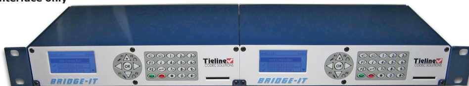
1RU Rack Frame (Optional Accessory) with two Bridge-IT Codecs installed